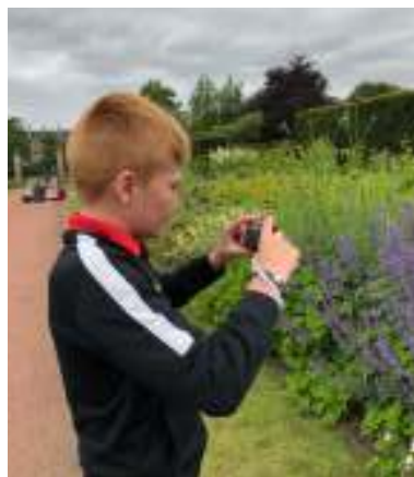
Grow and Learn in Nature

With thanks to our funders Scottish Natural Heritage (SNH) (Outdoor Learning in Nature), since April, we have been developing and delivering GLiN to five participating local schools. Weekly sessions see a total of 48 pupils and up to 12 teachers and support workers enjoying learning outdoors at Saughton Park. Our aim is to connect pupils and teachers to the benefits