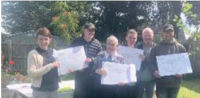
HYG and Potters awards