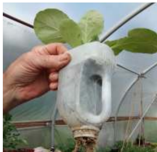
Self-watering pot (see opposite)