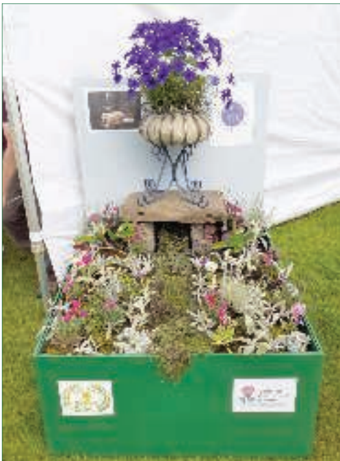
Tom's Pallet at Scone Palace Garden Fair 2022