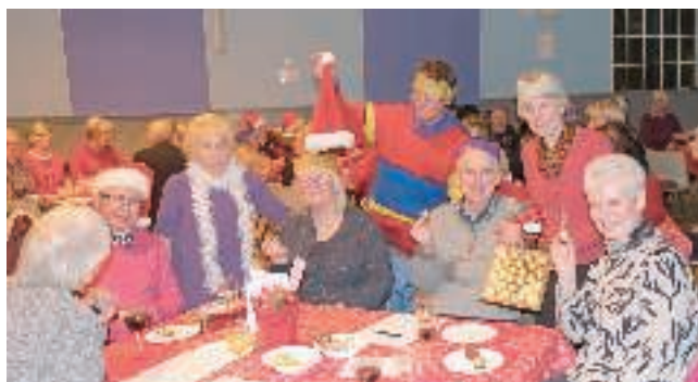
Fun and games at the Christmas Party