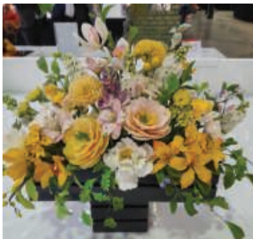
Floral arrangement entirely made of sugar

This year I have noticed a marked absence of small garden birds; the peanuts and fat balls seem to be ignored. However the dippers are very active in the burn, swimming underwater and then bobbing up to feast on the May fly larvae.