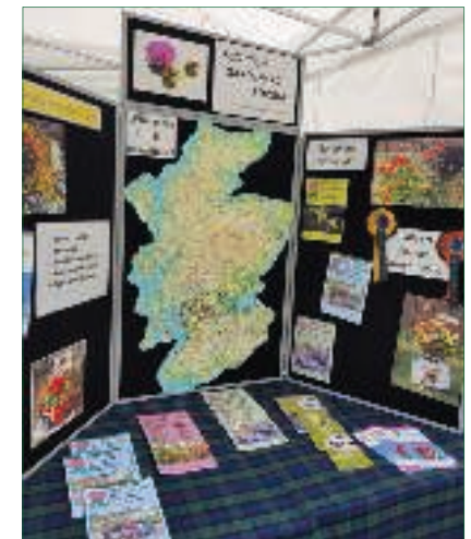
Our stand at Scone 2022