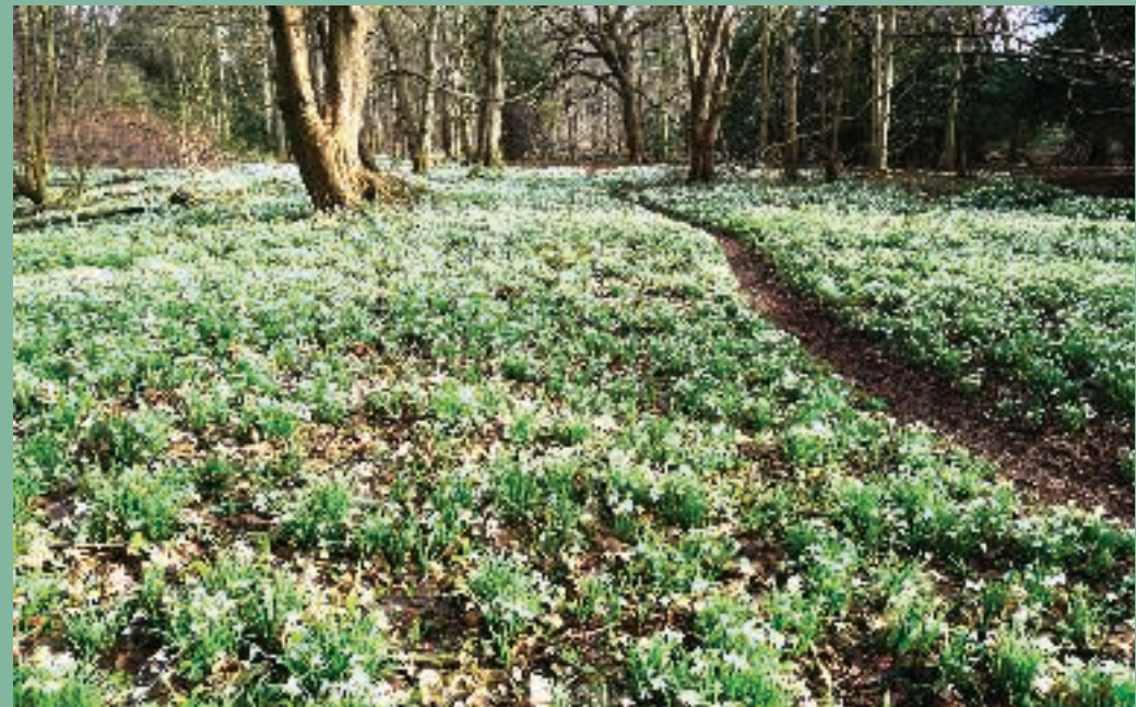
Snowdrops in Newbattle by Charles Black