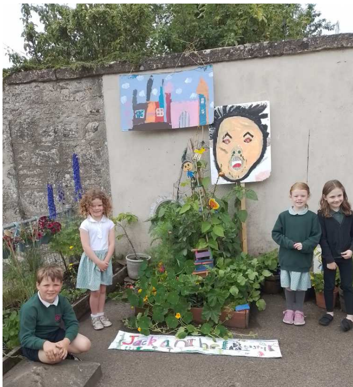
Jack and the Beanstalk at Rosebank

We were pleased to have another entry from 'Junior World' a childcare group which offers early years' day care and after school care. Their entry was 'A garden of celebration' as they had recently been awarded their 4th ECO schools Green Flag Award. In addition