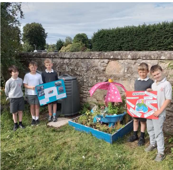
Pokémon Venusaurus at Millbank Primary School