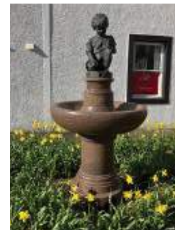
The only daffodils I could find in the Lakes was this display at the Wordsworth memorial in Cockermouth

Genus – Metasequoia glyptostroboides, Chinese Redwood