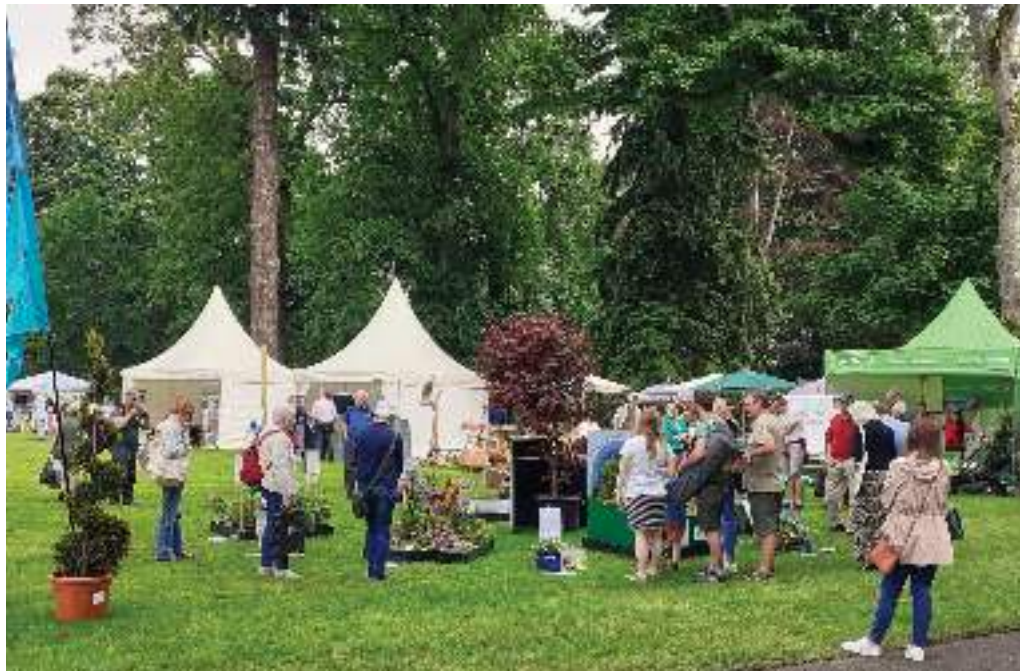
People are attracted by the display

If you're not already one of our regular participants in the P&P Challenge, why not think about indulging your creative urges and submitting an entry – it really is an enjoyable and fulfilling experience. The Challenge is well suited for schools and community groups to take part, so please reach out to others in your community and help them to join in and feel the benefits of creative gardening. SGF member clubs can apply for small grants to assist local organisations to take part in the