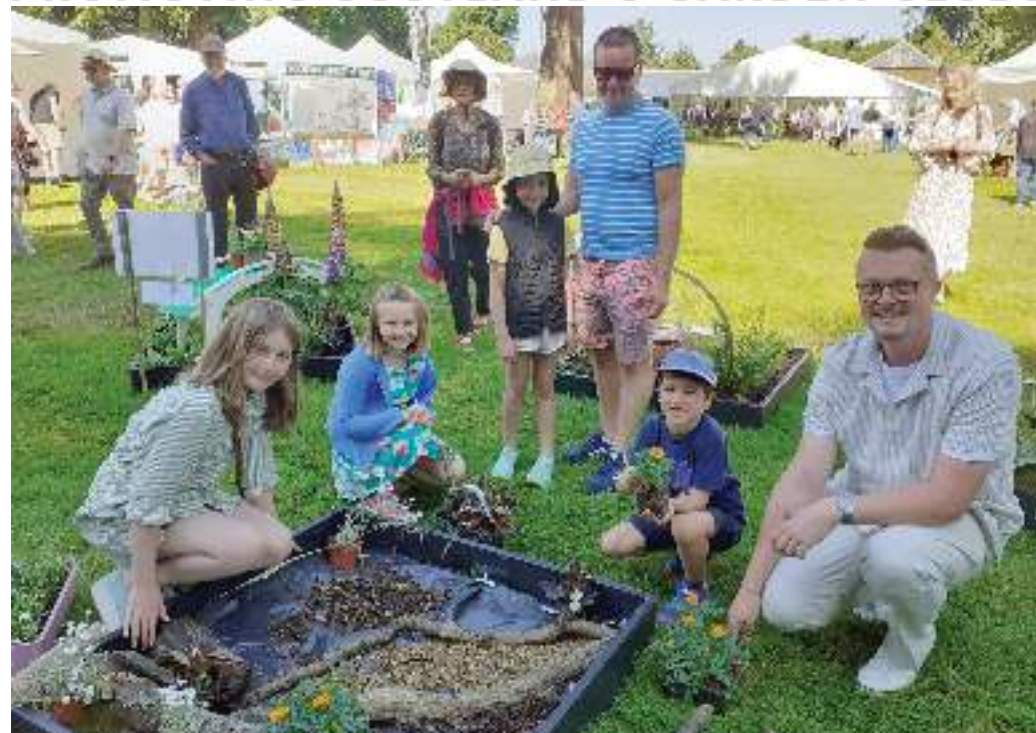
Fun at the Planters in 2024. See p12