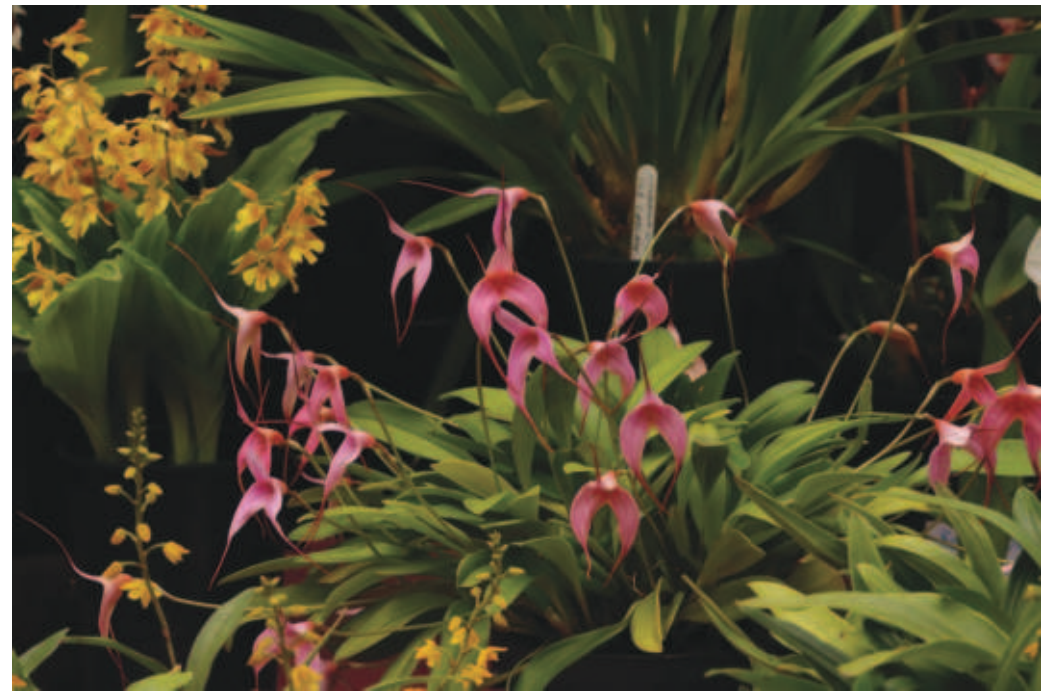
Orchid Fair (see p10)