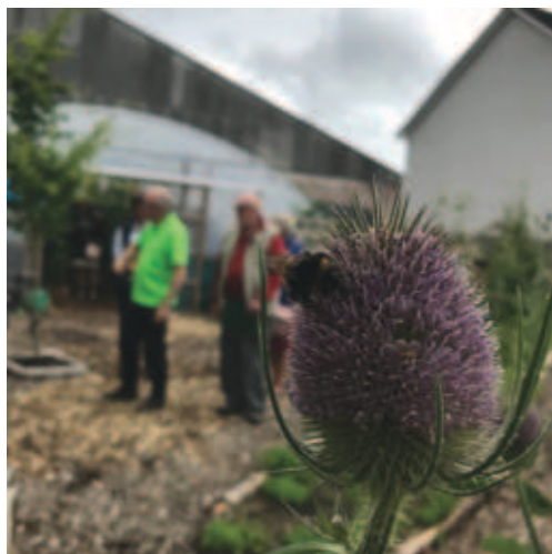
Bee on teazel on the GFL web is the link to expert advice